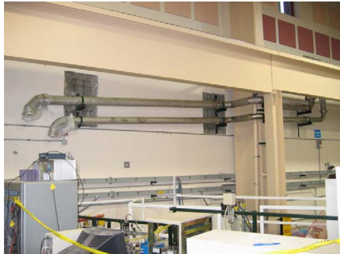
Vent lines inside the experimental hall at LANSCE for the NPDGamma experiment.