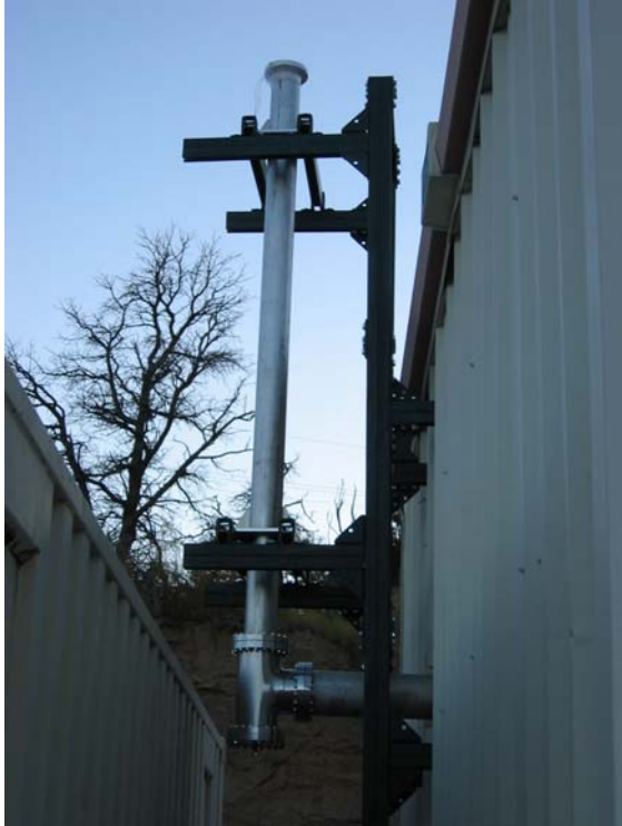
Vent stack in a shed outside of the LANSCE neutron guide hall. This stack is required for the liquid hydrogen target test before introduction of the hydrogen target onto the beamline.